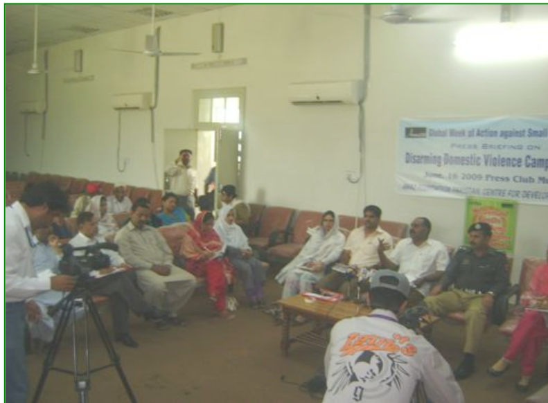
Different CSOs, CBOs, NGOs Members, Media Representatives and Students