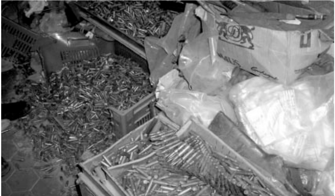
Poor ammunition storage

Explosions within an ammunition storage area can cause devastating damage and casualties in neighbouring communities. In addition to the direct human, social and economic costs of the explosion, the economic costs of the subsequent explosive ordnance disposal (EOD) clearance process can be very substantial.