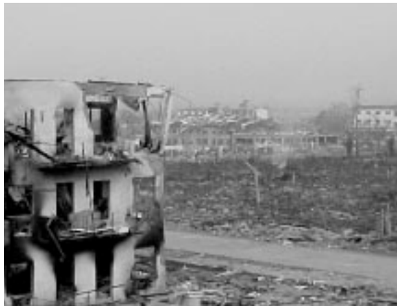
Effects of ammunition storage area explosion, Lagos, Nigeria, 27 January 2002

Risks can only be kept at tolerable levels if the ammunition management systems and storage infrastructure are to appropriate standards or in accordance with 'best practices'. A recent desk study by the Geneva International Centre for Humanitarian Demining (GICHD), 21 supplemented by some further research at SEESAC, has identified a significant number of recent explosive events that have occurred due to inappropriate storage or explosive safety procedures. Table 1 lists some recent explosive events at ammunition storage areas. The research data was obtained from Internet searches and a very limited response to a formal request for information. 22 It is no doubt incomplete: there are probably very many more incidents that have yet to be identified. Moreover, appearance on this list should not allocate or imply blame for the explosive event. Due to the patchiness of public information, appearance on this list may be testimony to the transparency and willingness of the State authorities involved to identify and learn lessons: many authorities take a less responsible approach.